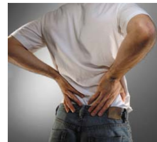
Soothe sore muscles, joints and back with Peppermint & PanAway

Peppermint and PanAway ease stressed muscles and joints. Make a custom massage oil by mixing six drops of either essential oil with one or more tablespoons of V-6 Pure Vegetable Oil Complex. Massage onto affected area. Or just apply topically and cover with a moist, hot towel. Feel the relief soak in deep.