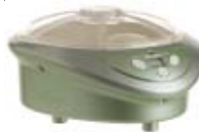
NEW Ultrasonic Diffuser

This new diffuser can atomize any essential oil, no matter how thick, by using water and ultrasonic vibration to disperse the oil into the air.