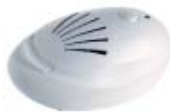
NEW Travel Diffuser

Now, with the new Travel Diffuser, purifying the air in your car or other small space has never been more convenient.