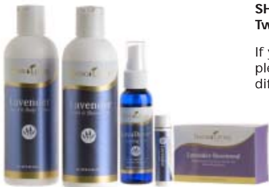
NEW Lavender Signature Series